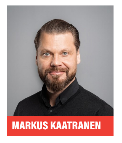
Chief Sales Officer (CSO)

Shares in Puuilo on 31 January 2023: 45,234