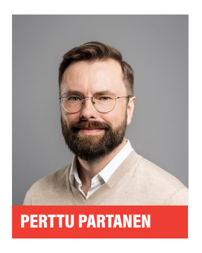
Chief Marketing Officer (CMO) (b. 1985, Finnish citizen)

Shares in Puuilo on 31 January 2023: 368,059