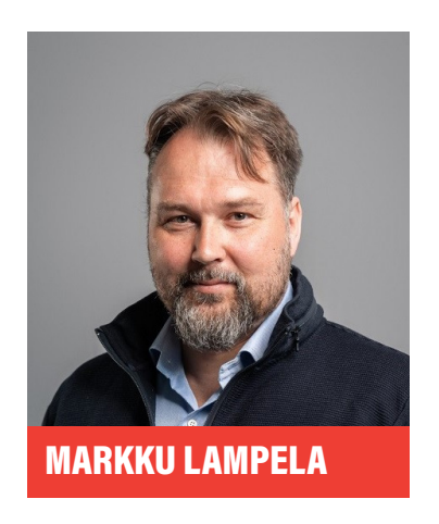
Chief Purchasing Officer (CPO) (b. 1971, Finnish citizen)