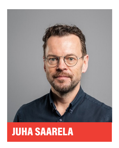
Chief Executive Officer (CEO) (b. 1974, Finnish citizen)